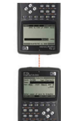
Communicate wirelessly through IrDA port

The HP 50g Graphing Calculator includes all the features of the HP 48gII plus: