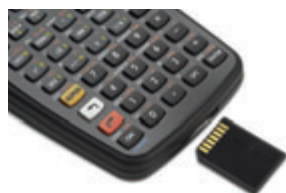
SD card slot for expanded memory and data transfer 1