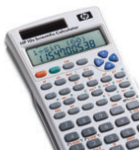
Dual Power: Solar and battery